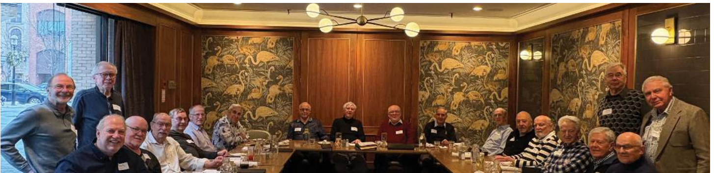
Men's Section 2025 AGM at the Hot House in Toronto