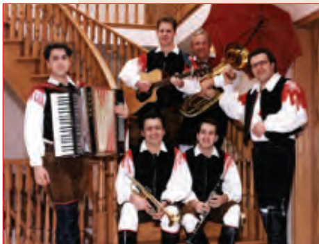
The Trillium Alphorns

Come with your family, make new friends and renew old acquaintances. Enjoy delicious Swiss food, have a Nussgipfel with a coffee, buy some souvenirs, and don't forget our famous raffle!