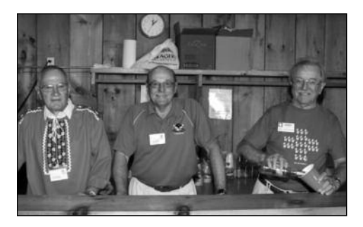
At the bar