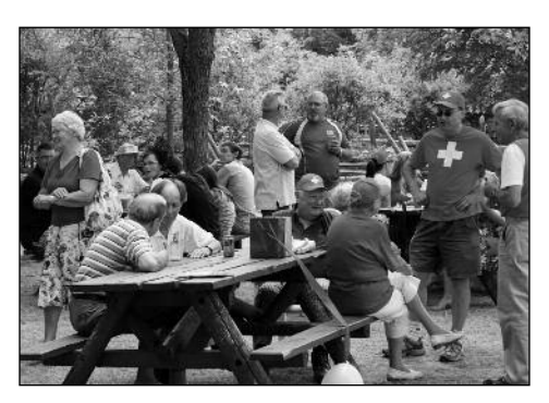
Enjoying the day with friends and family