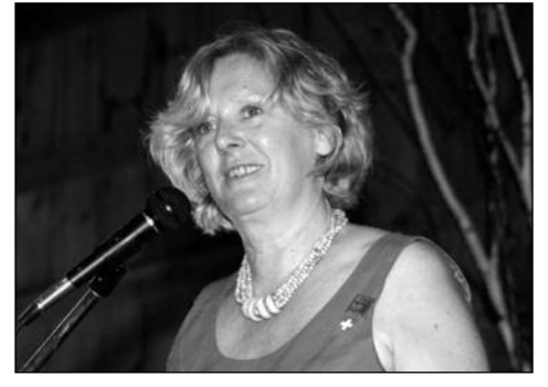
Consul General Bernadette Hunkeler-Brown