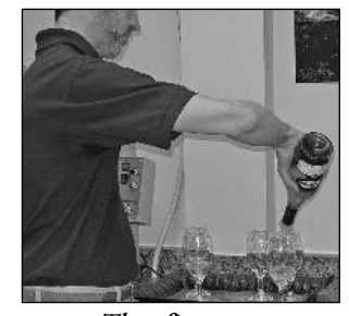
That first taste