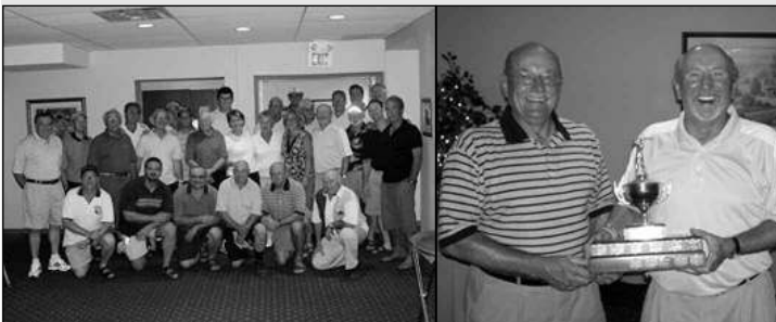
The 28 Participants